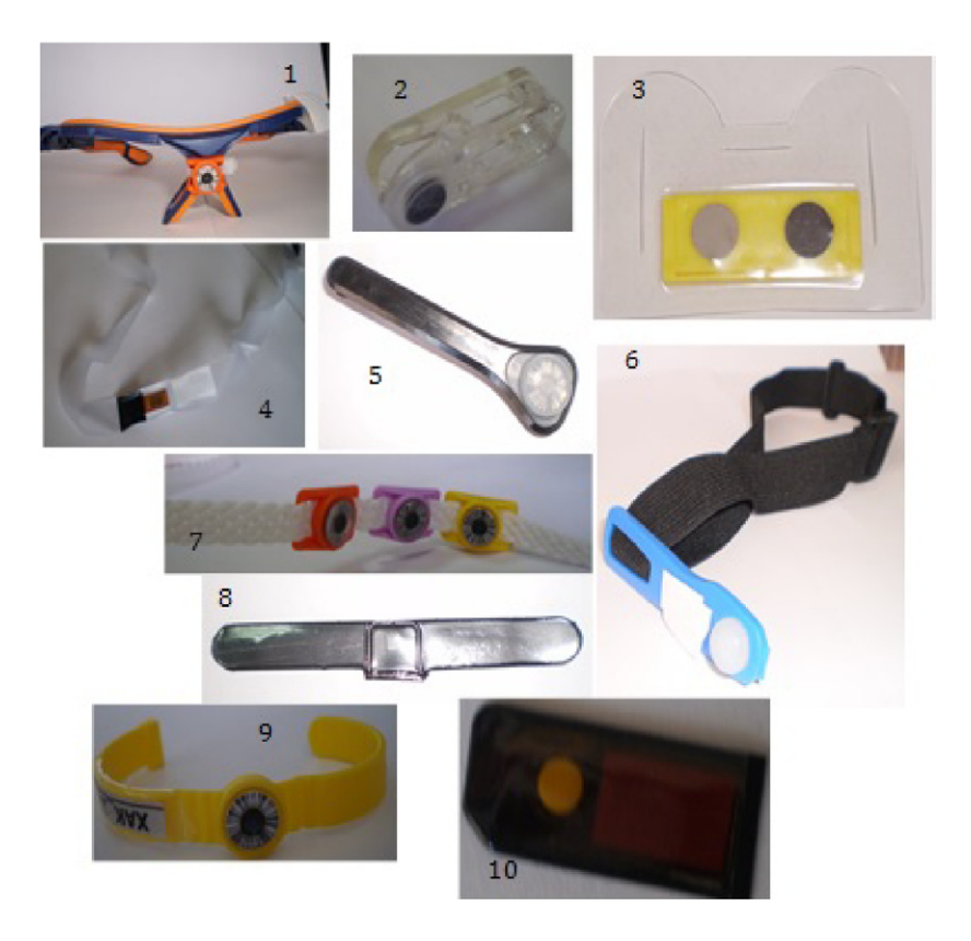
Figure 2. Some of the dosemeters that participated in the EURADOS eye lens dosemeter intercomparison.

Personal Dosimetry Service (PDS) of PHE decided to use existing resources in order to monitor the eye lens doses. The dosemeter includes a polytetrafluoroethylene (PTFE) filter of 1.5 mm thickness. The filtration is equivalent to 3.3 mm of tissue, closely matched to the definition of H_p(3) (ICRU 1993). The dosemeter element is the Harshaw EXTRAD<sup>TM</sup>, as the one used in the PHE finger. The EXTRAD<sup>TM</sup> element and the PTFE filter are heat-sealed together in a polyvinyl chloride (PVC) pouch, which is part of a PVC head band. The PHE eye dosemeter was type tested and passed all the tests described in the relevant ISO standard (ISO 2000) and in the ORAMED recommendations (Bordy et al 2011b).